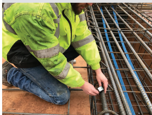
Construction worker installing SmartRock Plus sensor on rebar

"Today, young engineers and their project managers want everything on their phone or iPad – not their desktop."