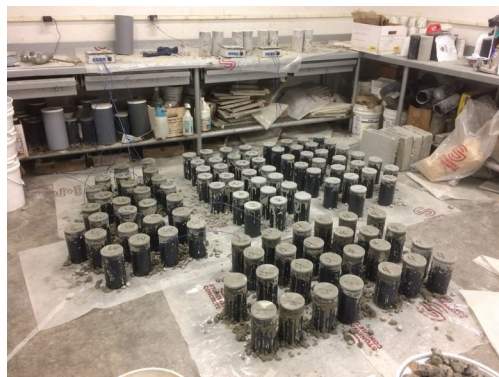
Test cylinders being cured in laboratory

To illustrate the value of SmartRock Plus – and the relative ease of selling this to a knowledgeable contractor – McKinnon describes the recent experience of a major high-rise building developer. The initial job schedule called for post tensioning every three days – where a deck is poured and sits for two-days before tensioning. After their first pour, and using SmartRock Plus – with sensors providing real-time information – the developer found that the mix they were planning to use made strength after one day. "So instead of tensioning at three days, they adjusted their schedule to a two-day pour schedule," confirms McKinnon. "Effectively, the developer took a day-off every floor they were going to pour," he adds.