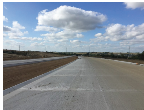
Completed Concrete Highway

Having passed the DOT of South Dakota's inspection test with flying colours, Concrete Materials and T&R Contracting are excited about the prospect of using Smart Concrete on other state road and infrastructure projects. "Going forward, Smart Concrete will be a standard in our big paving projects," says Simunek.